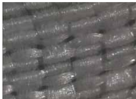
Figure 5. Ribbond (Ribbond) viewed under a light microscope.