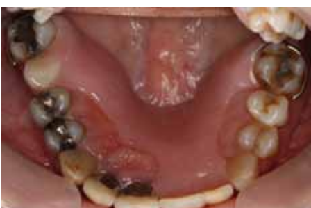
Figure 3. Acrylic partial denture kept free of the gingivae and retained by wrought clasps and guide planes.

forces towards those regions best suited to support can help to maintain healthy residual ridges. Uncontrolled distribution of forces may result in point loading and loading of the tissues that are less able to tolerate the forces than those planned as primary support areas. Any method of reducing stress on the residual ridge is desirable and common methods are: correct