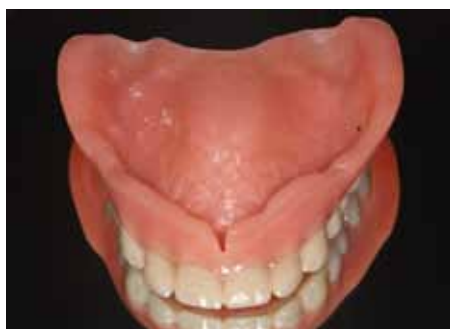
Figure 4. A maxillary complete denture with deep mid-line fraenum notch processed in 'high-impact' acrylic (Metrocyl HI, Metrodent).