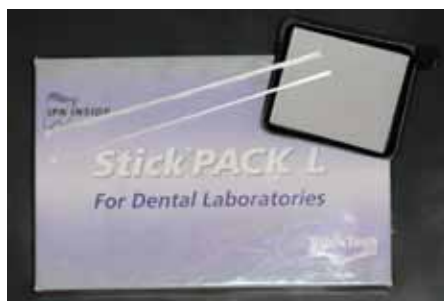
Figure 6. Continuous and woven glass fibres.

Glass fibres can be adhered effectively to denture acrylic by silane coupling agents, resulting in significantly