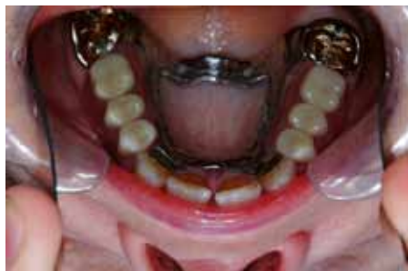
Figure 2. Tooth support offered by occlusal rests on a cobalt chromium framework.