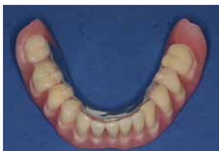
Figure 7. Characterization and pigmentation of acrylic gingivae.

improved stiffness, flexural and impact strength. 22,23 Good wetting of the fibres is essential for good adhesion, which can be compromised by polymerization shrinkage of the resin, leading to disruption of the fibres and decreased bond strength. Pre-treatment ('impregnation') of glass fibres with a thin PMMA–MMA slurry results in better wetting and, consequently, a greater reinforcing effect, yet avoids the exaggerated polymerization shrinkage and dimensional change that would occur if the fibres were wetted with monomer liquid alone. 24